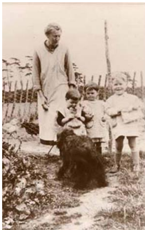
Foster mother 1930