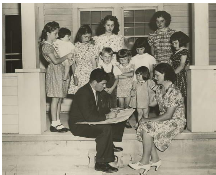
Census taker USA